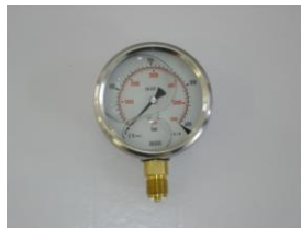
CODE: HP-500.88.10312 SLUMP GAUGE BOTTOM MOUNT