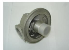
CODE: HP-MPS100RG1T OIL FILTER HOUSING