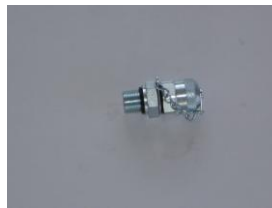
CODE: HP-ACCTETPSMK20916 SLUMP LINE FITTING MOTOR 9/16"