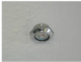
CODE: HP-SM1 SIGHT GLASS 1" WITH WASHERS