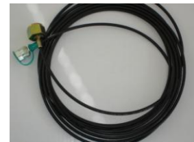
CODE: HP-T20-7000G SLUMP LINE SMALL (TEST 20 X 1 GAUGE END)