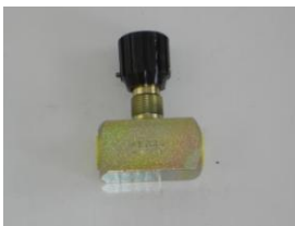
CODE: HP-DV10.17.1/0 FLOW CONTROL VALVE NEEDLE