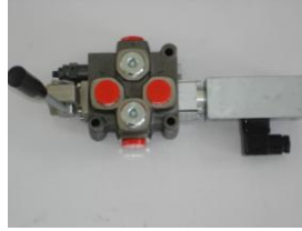
CODE: HP-RCVELEC REAR CHUTE VALVE ELECTRONIC