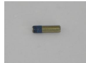
CODE: HP-M8M8 STUDS M8