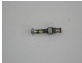
CODE: HP-12C215 HYDRAULIC PUMP SLUGS