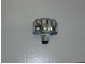
CODE: HP-SES8-10-05B1200 OIL TANK CAP (BREATHER 3/4" BSPP)