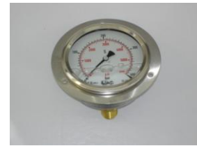
CODE: HP-500.888.108310 SLUMP GAUGE REAR MOUNT