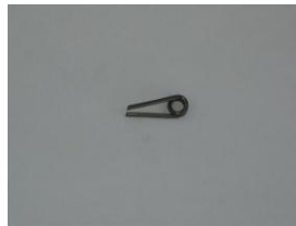
CODE: CHUTE VALVE SPRING RETURN Q45