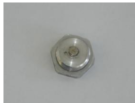
CODE: HP-718403047A GEARBOX PLUG