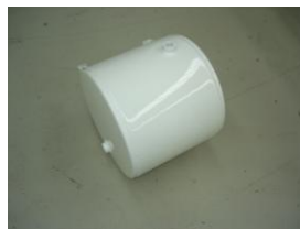
CODE: HP-DIMEO/501 HYDRAULIC OIL TANK