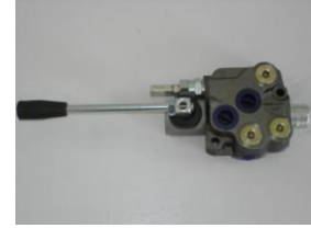
CODE: HP-ML/1/GZAIL REAR CHUTE VALVE MANUAL