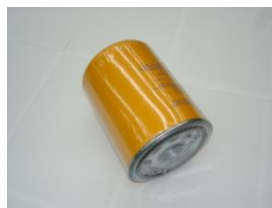
CODE: HP-CS100P10A OIL FILTER SMALL (INNER O-RING)