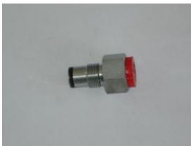
CODE: HP-VST112EDA3C 1/2" BSPT PLUG HOLLOW HEX HEAD