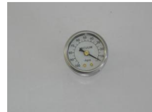
CODE: HP-1610601 VACCUM GAUGE