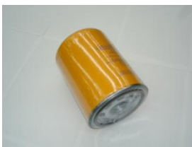
CODE: HP-CG100P10A OIL FILTER LARGE (OUTER O-RING)