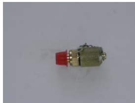
CODE: HP-TEST20 7/16 UNO SLUMP LINE FITTING MOTOR 7/16"